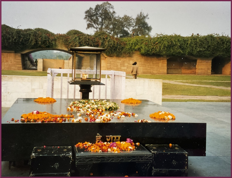
Rāj Ghāt Memorial to Mahatma Gandhi in New Delhi.