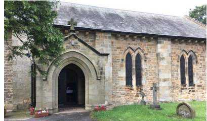
St Andrew's Church, Sadberg

We don't have anything other than our Sunday Service, but we are hoping to hold a fund raising coffee morning in the village hall.