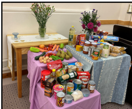
Produce donated at the Harvest