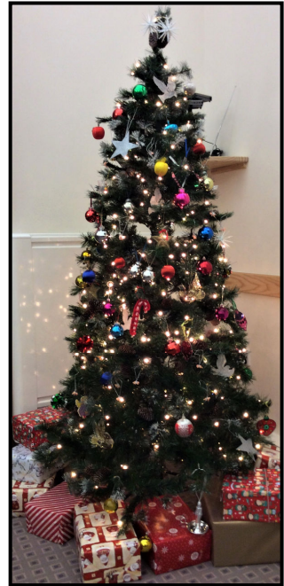
Shoeboxes for the Mission to Seamen, under the Christmas Tree