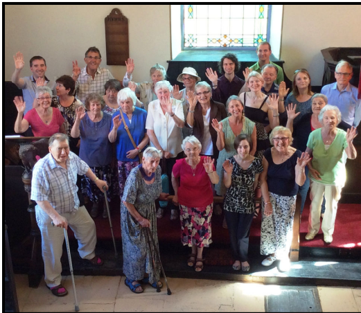
Our visit to Whitby in 2017