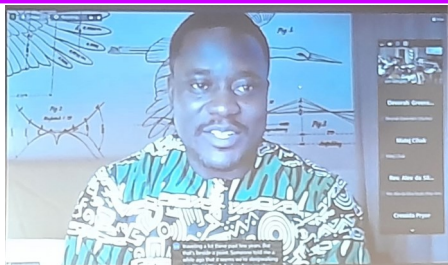
Prague 27 October 2023 Day Two Keynote Speaker Bayo Akomolafe