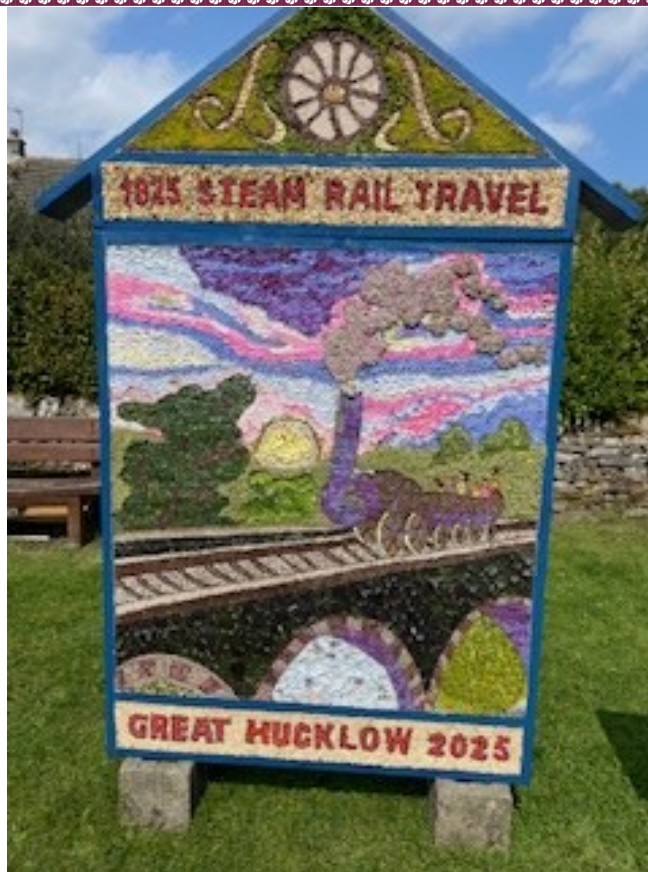
Photo of the Well Dressing at Great Hucklow in Derbyshire in August 2025.

The 200th Anniversary of the Stockton and Darlington Railways is being celebrated in Stockton on the 26th to the 28th September 2025.